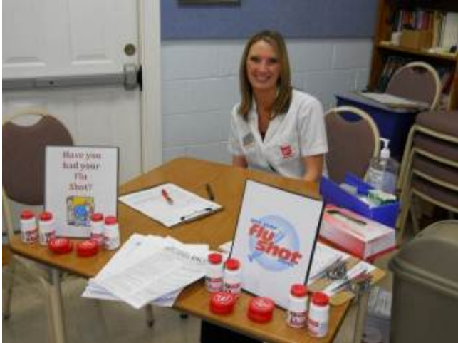
Have you had your flu shot?