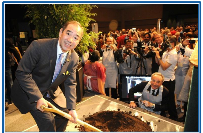
International President Tam demonstrates how to use a shovel at the convention on July 5, 2011

A number of resources are available to assist you in completing a tree planting project. For materials and campaign updates go to www.lionsclubs.org or contact the International Department of Service Activities Division at programs@lionsclubs.org .